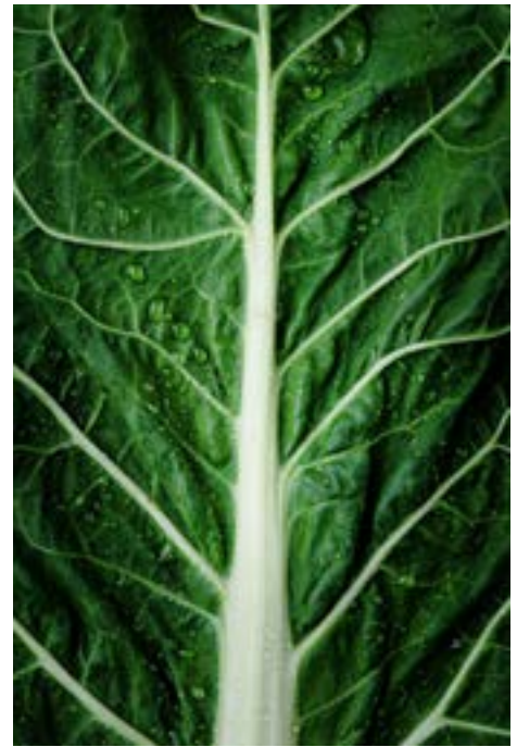
Featured Image #3 Yone Liao | The Tree of Life in a Chard