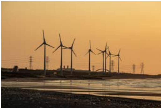
Featured Image #1