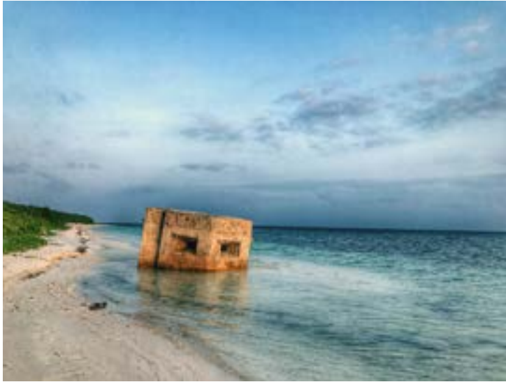
Featured Image #2 Shashank Keshavmurthy | Beach on Dongsha Atoll