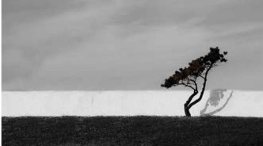
Featured Image #3

Patrice Delmotte | Lighthouse garden, Matsu Island